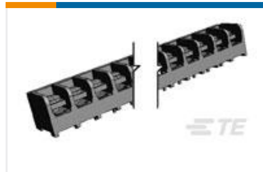
TE Part #1437654-7 6PCV-18-006=ASSEMBLY