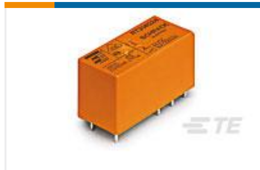
TE Part #3-1393240-5 RT33L024