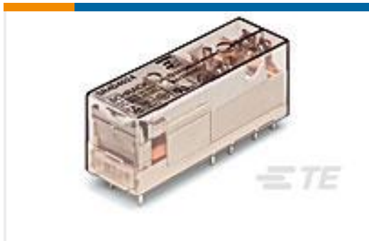
TE Part #8-1415053-1 SR4M4012