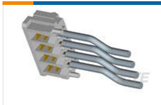
TE Part #173977-4 CT CONN MT REC ASSY 4P