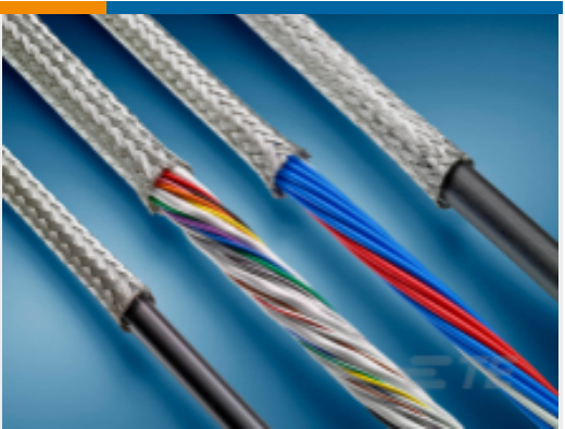
TE Part #CQ50513001 RAY-103-10.0(10)