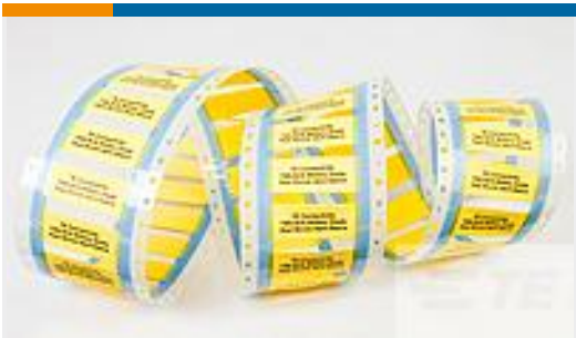
TE Part #6315830001 TMS-SCE-3/4-2.0-4