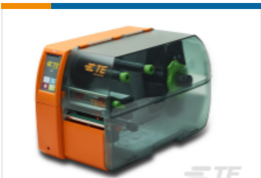
TE Part #1-2186502-1 T3224-PRINTER