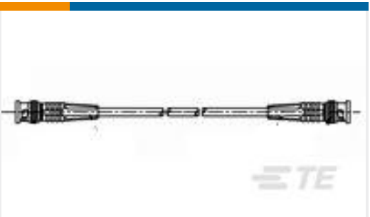
TE Part #1337771-8 50 OHM COAX BNC STR PLUG P99-E