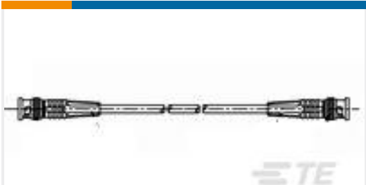
TE Part #1337771-4 50 OHM COAX BNC STR PLUG STR P