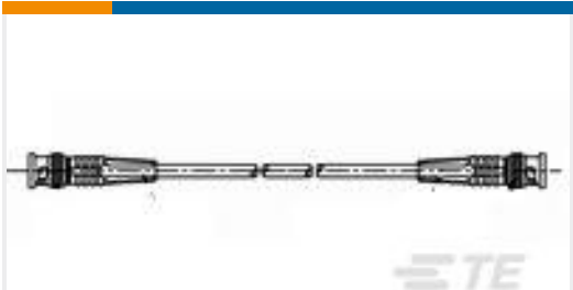
TE Part #1337771-2 50 OHM COAX BNC STR PLUG STR P