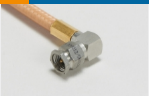
RF Cable Assemblies(2)