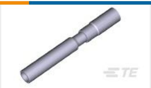
TE Part #193842-1 SKT ASSY., 2MM, 12-14 AWG