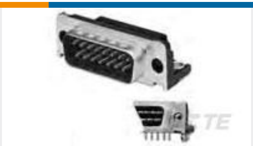
TE Part #747250-4 09 MSFL PLUG RA 318 (IN,FM)