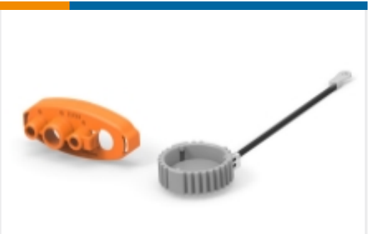
Connector Caps & Covers(3)