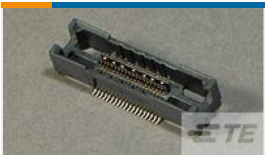
TE Part #2-767004-2 MICT,RECPT,038,ASSY.,025,REC