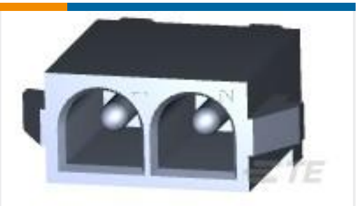
TE Part #194009-1 PIN ASSY..070