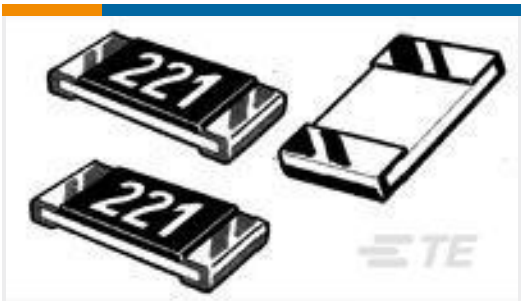
TE Part #5-2176070-3 3521 1K5 1% 2W