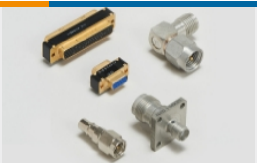
Connector Adapters & Connector Savers(8)