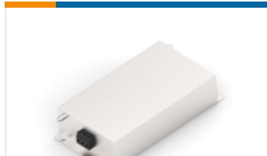
TE Part #1-1609969-2 KEH 20A 2S SP DELTA 440VAC