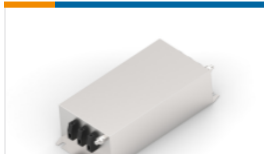
TE Part #1-1609969-6 KEH 100A 2S SP DELTA 440VAC