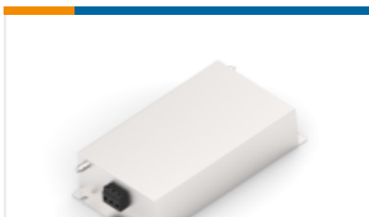
TE Part #1-1609969-4 KEH 60A 2S SP DELTA 440VAC