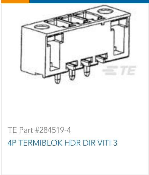
TE Part #284519-4 4P TERMIBLOK HDR DIR VITI 3