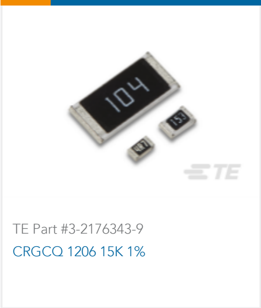
TE Part #3-2176343-9 CRGCQ 1206 15K 1%