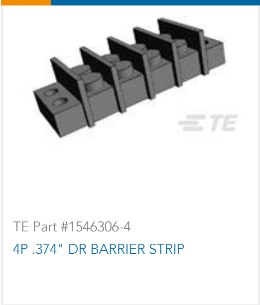
TE Part #1546306-4 4P .374\"/>