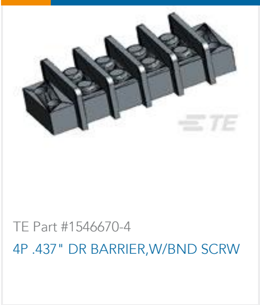
TE Part #1546670-4 4P .437\"/>