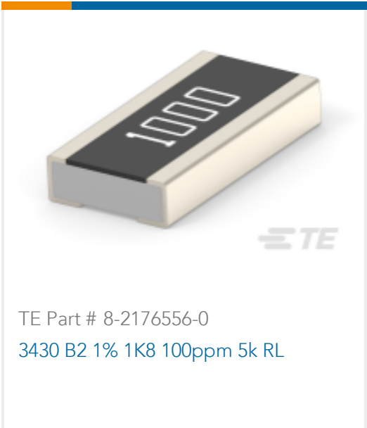
TE Part # 8-2176556-0 3430 B2 1% 1K8 100ppm 5k RL