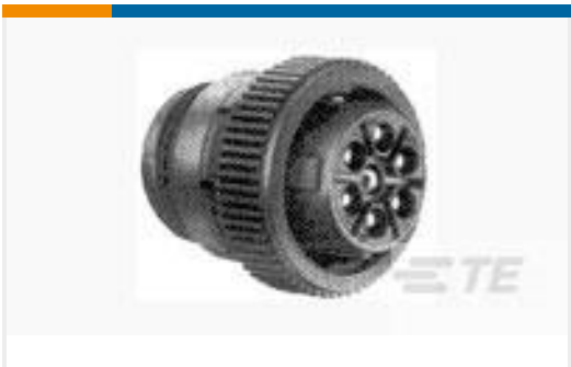
TE Part #211399-1 CPC PLUG ASSEMBLY SIZE 13-7