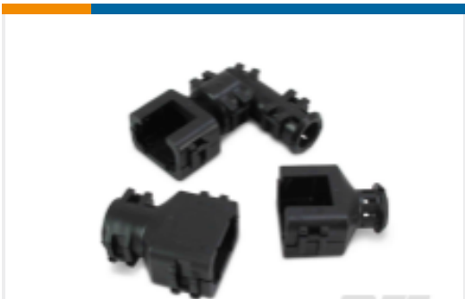
TE Part #2292862-3 AMPSEAL 16 Connectors Backshell