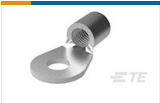
TE Part #33114 TERMINAL,SOLIS R 4 10