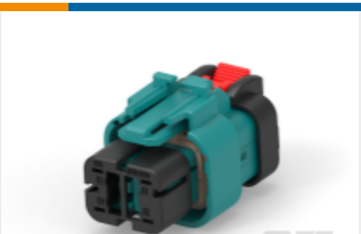
TE Part #2338212-1 PLUG SOCKET ASSY, 4P, W2W, SEALED COAX