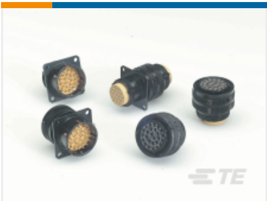
TE Part #ZPF00000000019010 FDBA 54-22-21 SN-K