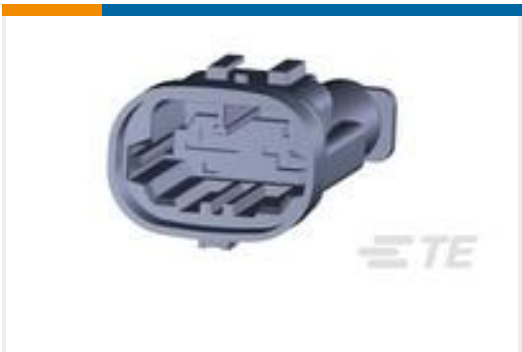
TE Part #1544980-4 TAB HOUSING, 8MM NG1 PLUS, 2 WAY