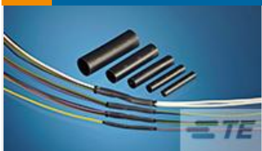
TE Part #EG82336001 QSZH-125-NR3-120MM