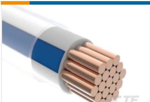
TE Part #CD92823001 ACW0219-0.35-12(NS)