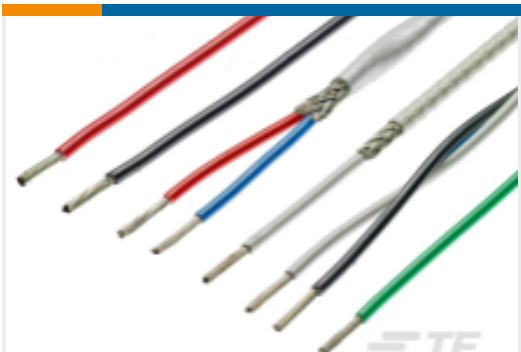
TE Part #5383803001 99M0211-22-2L