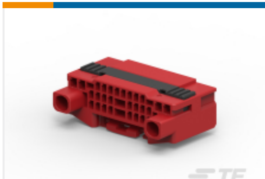
TE Part #2188391-6 025/060/110 HYB 30P PLUG ASSY RED