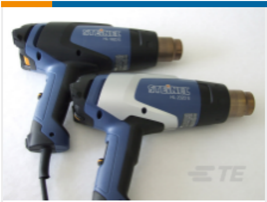
TE Part # EG8162-000 HL1920E-230V-EURO