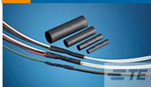
TE Part #0021036036 RBK-ILS-125-NR3-0-80MM