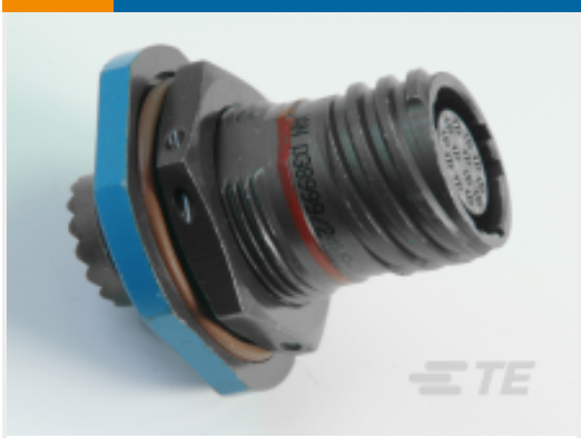
TE Part #YDTS24W17-08BAV001 RECP ASSY