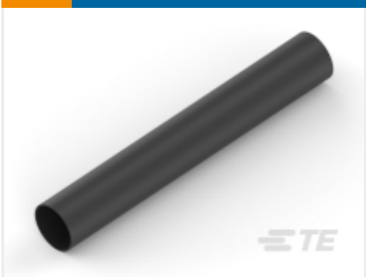
TE Part #NB11166001 ATUM-40/13-0-85MM