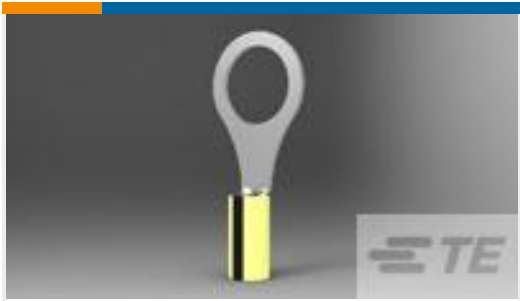
TE Part #330896 TERMINAL,PIDG R 16-14HD 3/8