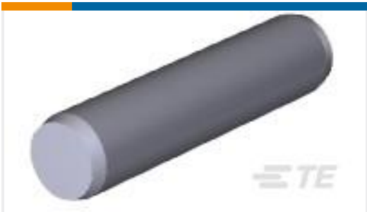
TE Part #201501-1 SPIROL PIN