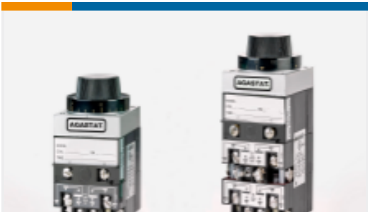
TE Part #1-1472973-6 7012PHC696=RLY,STD,ON,2P,125VDC, 30MIN,C6