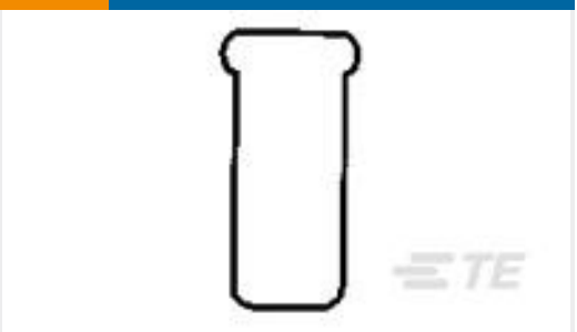
TE Part #328308 SPARE WIRE CAP,BLU, 16-14 AWG