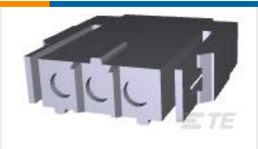
TE Part #207360-1 PLUG HSG,3 POSN,METRIC