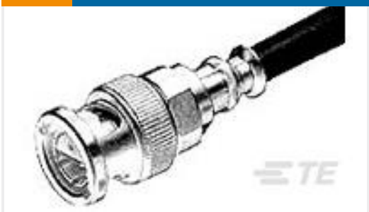
TE Part #5332225-5 PLUG, TWIN BNC,