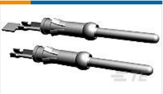
TE Part #66602-2 III+ PIN,18-14,30AU/FL,LP