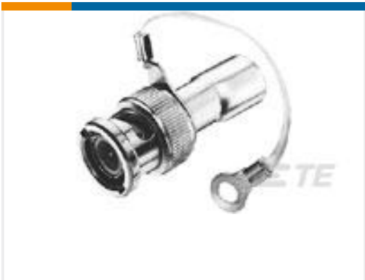
TE Part #5221629-2 TERMINATOR,BNC,75 OHM,1 WATT