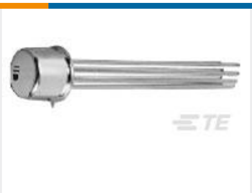
TE Part #1617125-2 JMAW-12XM = M39016/9-016M