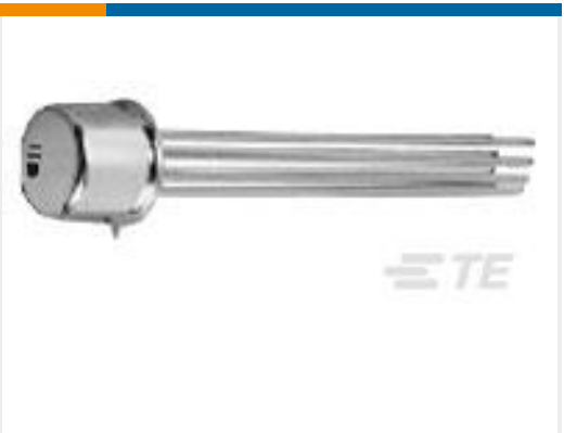
TE Part #1617351-5 J1MAW-12XM=M39016/7-019M