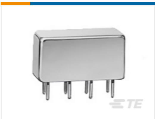
TE Part #2-1617033-5 HFW1230G01P = M39016 /6-112P