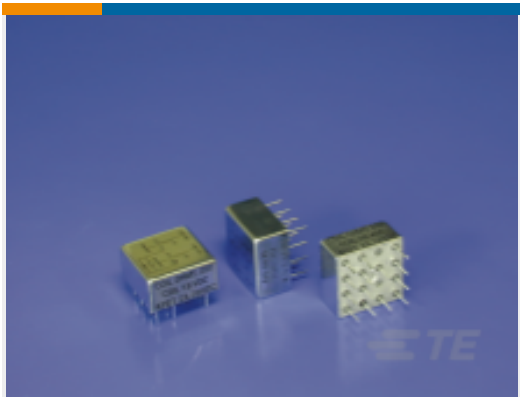
TE Part # 2-1617076-6 3SBH1231A2 = M39016/53-012M