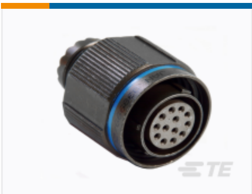
TE Part #YDTS26W19-35SNC001 PLUG ASSY