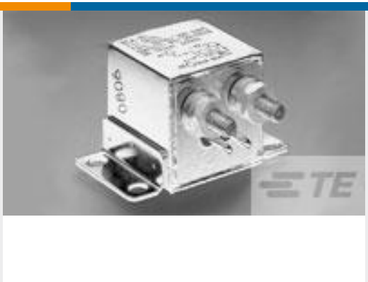
TE Part #1-1617795-0 FCA-150-BY4=Relay