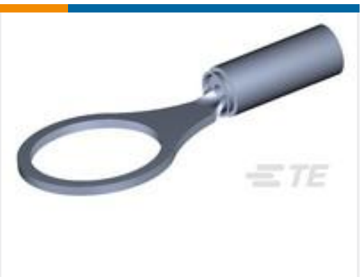
TE Part #1577629-1 TERMINAL RT PIDG PEEK STRATO 20 AWG