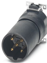
Contact carrier, 5-position, Pin, straight, M12, coding: B, PCB mounting, SMD reflow, Alternative product in accordance with RoHS II without Exemption 6c (Pb < 0.1 %) item no.: 1308199

Please be informed that the data shown in this PDF document is generated from our online catalog. Please find the complete data in the user documentation. Our general terms of use for downloads are valid.