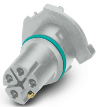
Contact carrier, Power, 5-position, Socket, straight, M12, coding: L, PCB mounting, THR solder connection

Please be informed that the data shown in this PDF document is generated from our online catalog. Please find the complete data in the user documentation. Our general terms of use for downloads are valid.