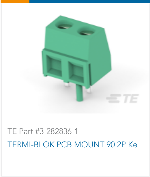
TE Part #3-282836-1 TERMI-BLOK PCB MOUNT 90 2P Ke