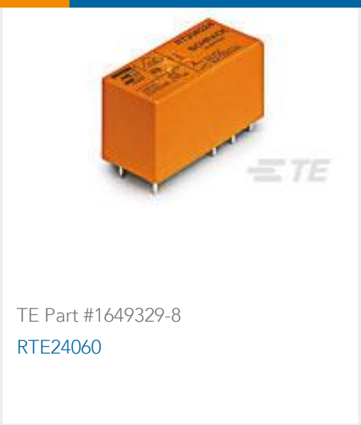
TE Part #1649329-8 RTE24060