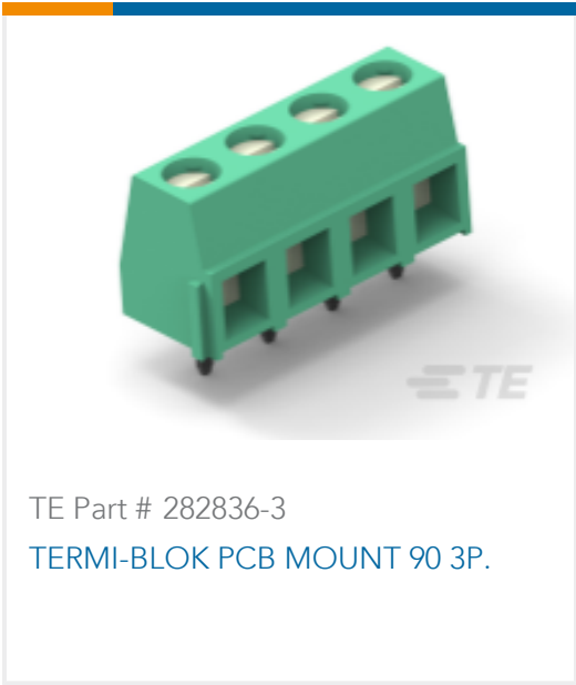
TE Part # 282836-3 TERMI-BLOK PCB MOUNT 90 3P.