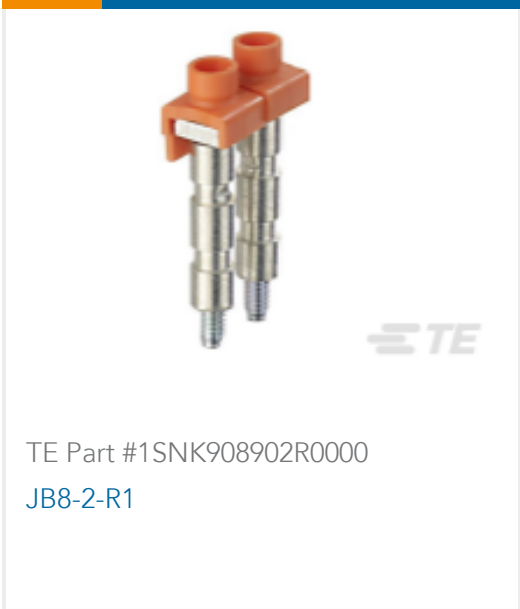
TE Part #1SNK908902R0000 JB8-2-R1