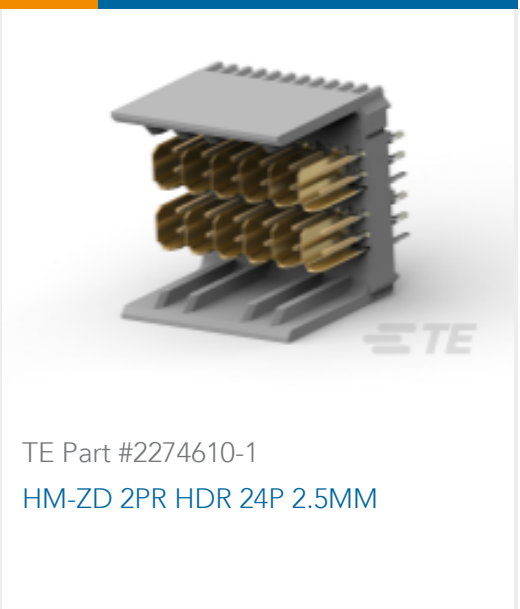
TE Part #2274610-1 HM-ZD 2PR HDR 24P 2.5MM