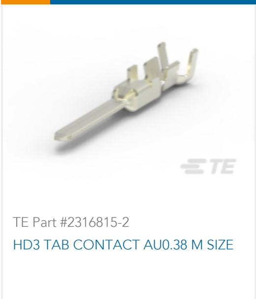
TE Part #2316815-2 HD3 TAB CONTACT AU0.38 M SIZE