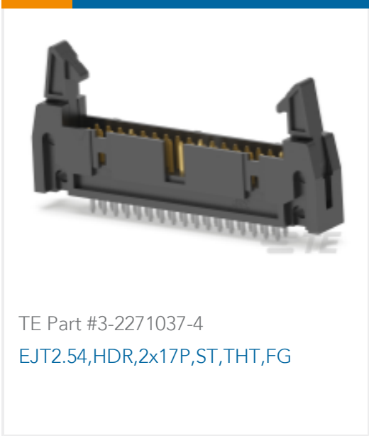
TE Part #3-2271037-4 EJT2.54,HDR,2x17P,ST,THT,FG