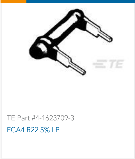
TE Part #4-1623709-3 FCA4 R22 5% LP