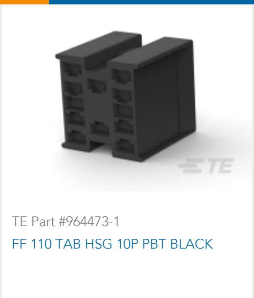
TE Part #964473-1 FF 110 TAB HSG 10P PBT BLACK