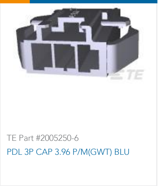
TE Part #2005250-6 PDL 3P CAP 3.96 P/M(GWT) BLU