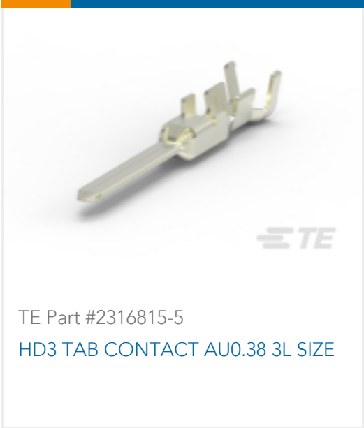
TE Part #2316815-5 HD3 TAB CONTACT AU0.38 3L SIZE