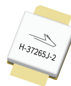
GTVA123501FA Package H-37265J-2

Advance Specification Data Sheets describe products that are being considered by Wolfspeed for development and market introduction. The target performance shown in Advance Specifications is not final and should not be used for any design activity. Please contact Wolfspeed about the future availability of these products.