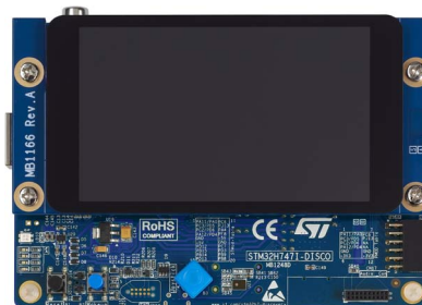
STM32H747I-DISCO (top view)