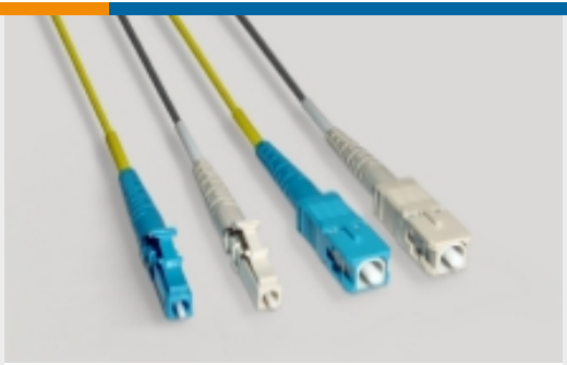
Fiber Optic Patch Cable Assemblies(85)