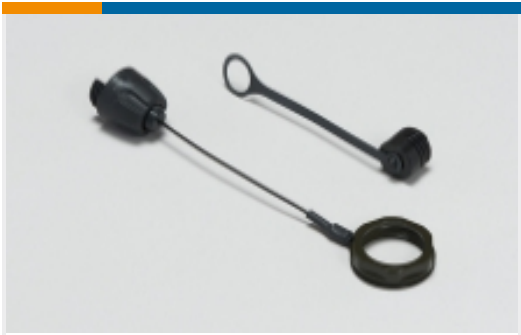
Fiber Connector Covers & Caps(1)