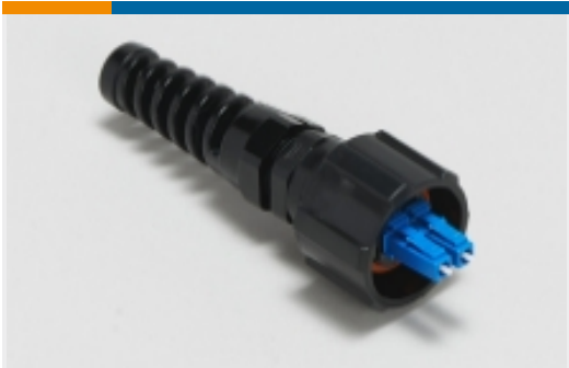
ODVA LC Connectors(4)