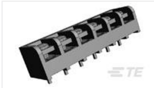
TE Part #8-1437648-0 4PCV-06-006=4PCV ASSEMBLY