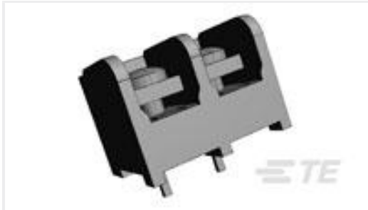
TE Part #3-1437652-9 6PCV-02-006=6PCV ASSEMBLY