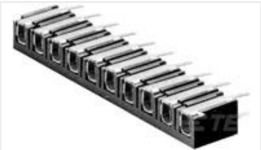
TE Part #87986-4 04 MODI BDMNT RCPT SR .156CL