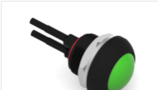
TE Part #2329362-4 PB OFF/ON RC GRE M1 TERM IP68 500MM LHS