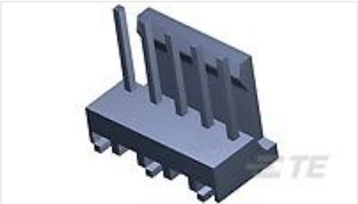
TE Part #3-647502-3 03P MTA100 HDR ASSY,SM,SN, LF