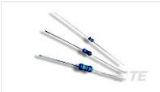
TE Part #1622342-1 LR1 1% 180R