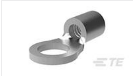
TE Part #8-34123-1 TERM,SOLIS R 16-14 10