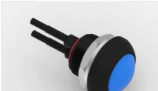
TE Part #2329362-5 PB OFF/ON RC BLU M1 TERM IP68 500MM LHS