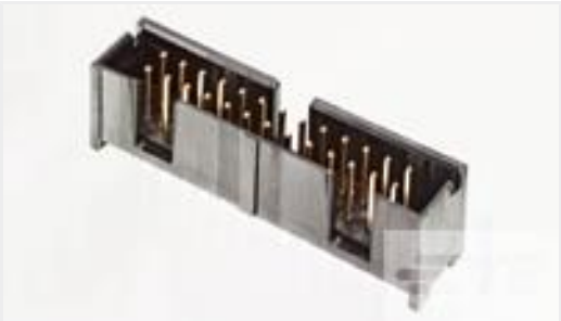
TE Part #5103308-3 A/L LOW PRO HDR 16P VERT BLACK