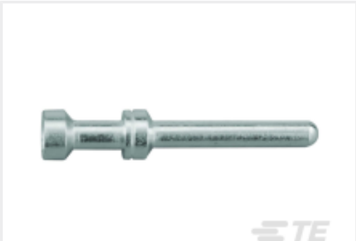
TE Part #T2030001002-000 CEM-0.3