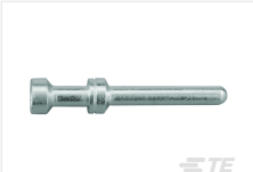
TE Part #T2030001005-000 CEM-0.5