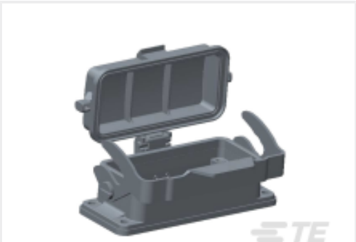
TE Part #T1510163000-000 H16B-AD-LB