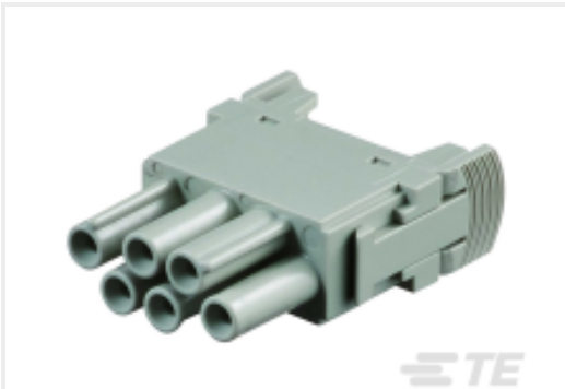
TE Part #T2111063201-000 HMN-006-PF