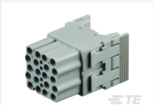
TE Part #T2111202201-000 HMN-020-F