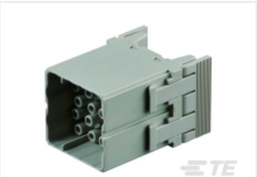
TE Part #T2111202101-000 HMN-020-M