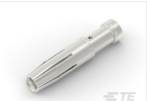
TE Part #T2030002030-000 CEF-3.0