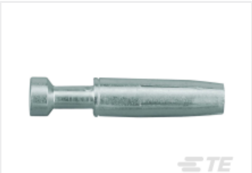
TE Part #T2030002002-000 CEF-0.3