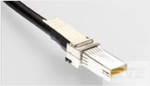
TE Part # 2142970-4 CABLE ASSY, MICRO SFP+ TO STD SFP+, 3M