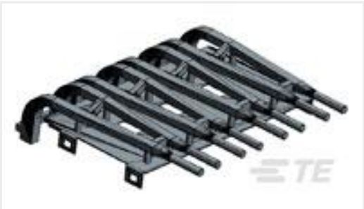
TE Part # 2170068-1 SFP+ 1x4 Light Pipe Assembly Low Profile