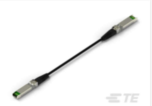
TE Part # 4-2334985-2 SFP56 DIRECT ATTACH CA, 1M, 32AWG