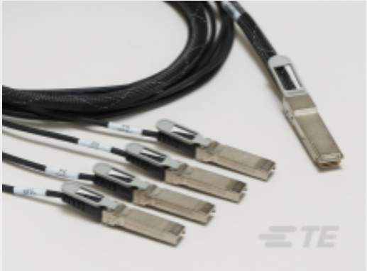
TE Part # 2821033-8 QSFP TO [4]SFP+, 28G, 1M, 33AWG