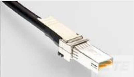
TE Part # 2142970-7 CABLE ASSY, MICRO SFP+ TO STD SFP+, 6M