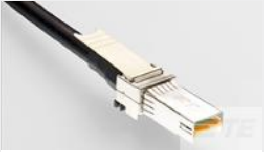
TE Part # 2142970-6 CABLE ASSY, MICRO SFP+ TO STD SFP+, 5M