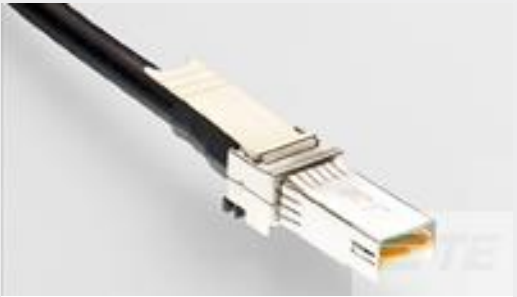
TE Part # 2142970-2 CABLE ASSY, MICRO SFP+ TO STD SFP+, 1M