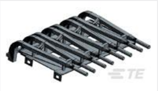
TE Part # 2007099-4 SFP+ 1x4 Light Pipe Assembly