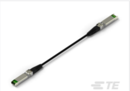
TE Part # CAT-C11-N4901114 SFP28 to SFP28 Cable Assembly: 30 AWG