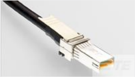
TE Part # 2142970-3 CABLE ASSY, MICRO SFP+ TO STD SFP+, 2M