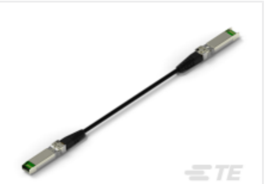
TE Part # 4-2821222-5 SFP56 DIRECT ATTACH CA, 2M, 30AWG