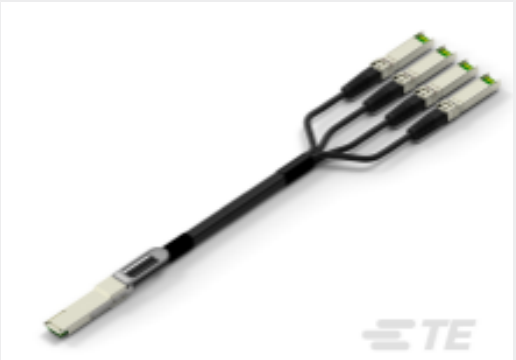
TE Part # CAT-C11-N490333 QSFP28-Four SFP+ Cable Assembly: 30 AWG