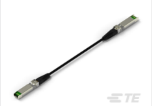
TE Part # 2334985-2 SFP28 DIRECT ATTACH CA, 1M, 32AWG