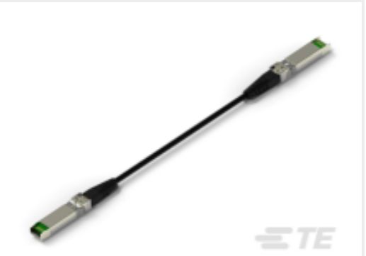
TE Part # 4-2821224-5 SFP56 DIRECT ATTACH CA, 3M, 26AWG