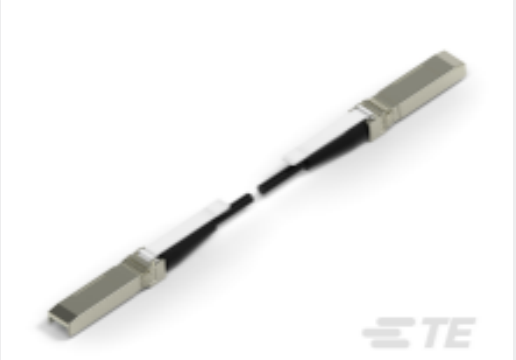
TE Part # CAT-C11-H5062 SFP+ to SFP+ I/O Cable Assembly: 28 AWG