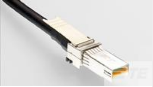
TE Part # 2142970-5 CABLE ASSY, MICRO SFP+ TO STD SFP+, 4M