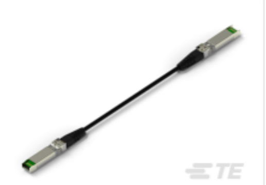
TE Part # CAT-C11-N49011 SFP28 to SFP28 Cable Assembly: 26 AWG