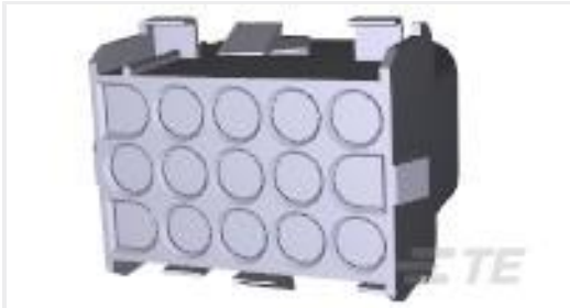
TE Part #1-480711-9 15P UMNL CAP HSG BLK