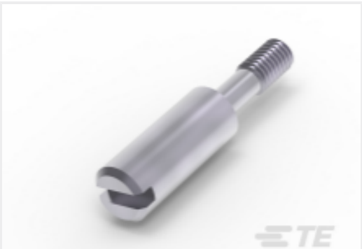
TE Part #T0931003003-000 CODING-PIN-M3