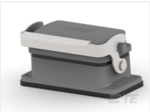
TE Part #T2120100220-000 ZGGP-H10BSK 1-7/2-8/3-9/4-6/5-10