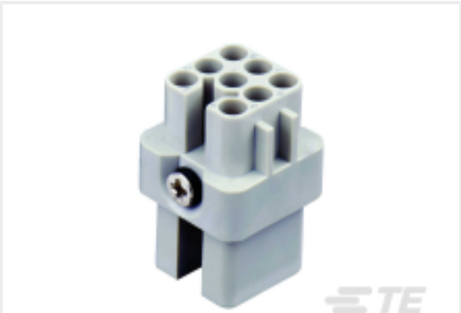
TE Part #T2020082201-000 HD-008-F