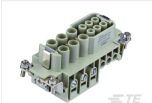
TE Part #T2106062201-000 HWK6/6-012-F