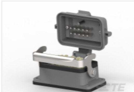
TE Part #T2120100219-000 ZGG-10DSTK,1-7,2-8,3-9,4-6,5-10