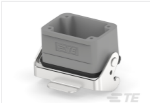
TE Part #T1730060000-000 H6B-TBF-T