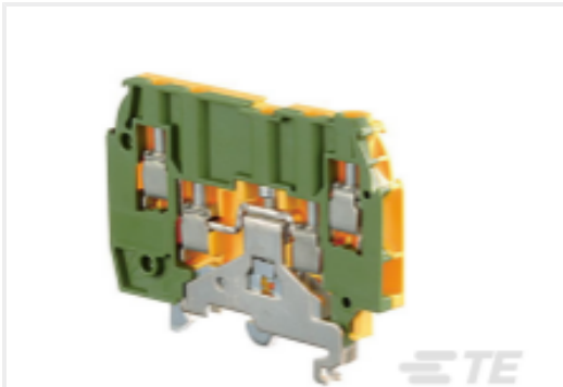
TE Part #1SNA195638R2300 M4/6.4A.P