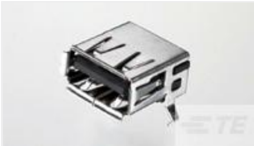
TE Part #292303-1 Std USB Type A, R/A, T/H