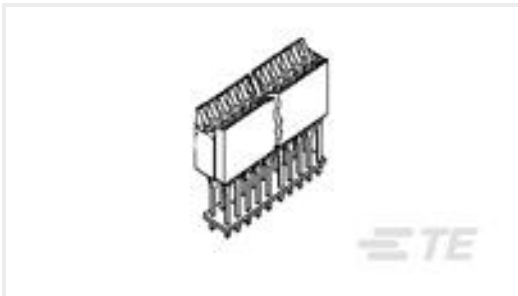
TE Part #5-650297-1 AMP PACE CONN 10POS 100X200C/L