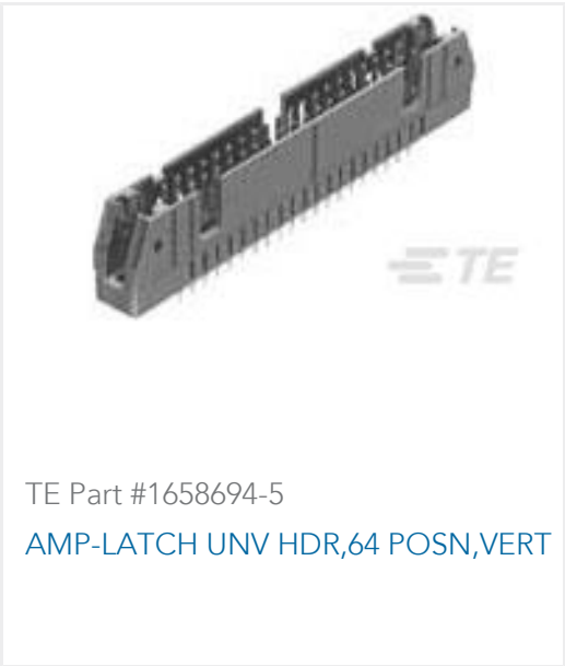
TE Part #1658694-5 AMP-LATCH UNV HDR,64 POSN,VERT