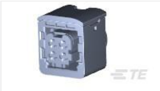
TE Part #1-1418390-1 4 POS AMP MCP 2.8 REC HSG