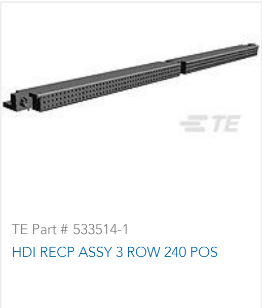
TE Part # 533514-1 HDI RECP ASSY 3 ROW 240 POS