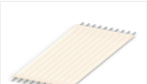
TE Part #3-1474644-2 FSN-24A-4