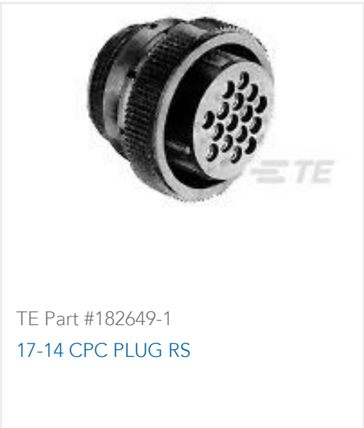
TE Part #182649-1 17-14 CPC PLUG RS