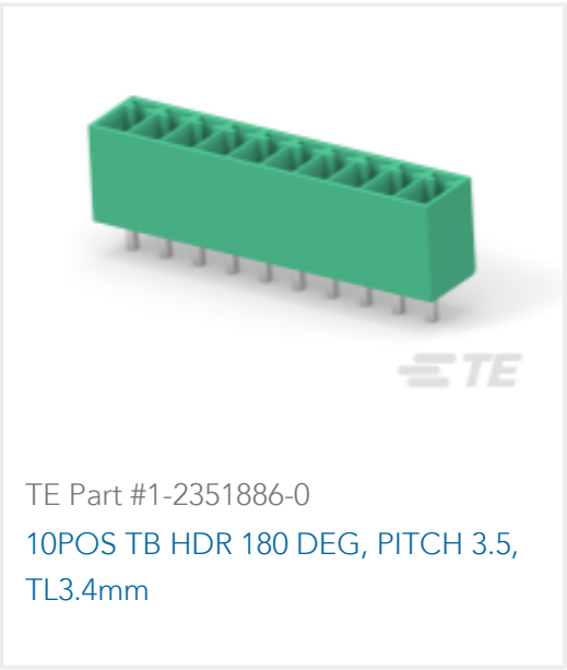
TE Part #1-2351886-0 10POS TB HDR 180 DEG, PITCH 3.5, TL3.4mm