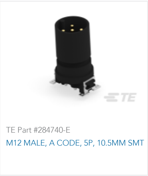
TE Part #284740-E M12 MALE, A CODE, 5P, 10.5MM SMT

3POS TB HDR 180 DEG, PITCH 3.5, TL 3.4mm