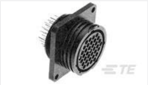
TE Part #2-208224-1 CPC RECPT ASSEMBLY SIZE 23-37