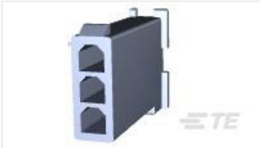
TE Part #172234-1 3P MINI UNIVERSAL MATE-N-LOK CAP HOUSING