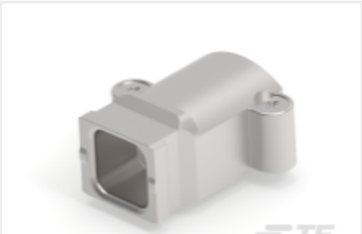
TE Part #1-2308272-4 CABLE CLAMP4 (CASE RAW)