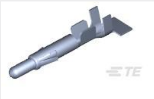
TE Part #350218-1 UMNL PIN 20-14 .0126PTPBR