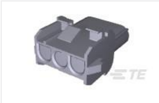
TE Part #350767-1 03P UMNL CAP HSG V0