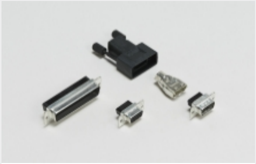
Crimp D-Sub Connectors(10)