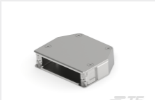
TE Part #1-2308327-1 FULL METAL HOODS SIZE 3 (1)