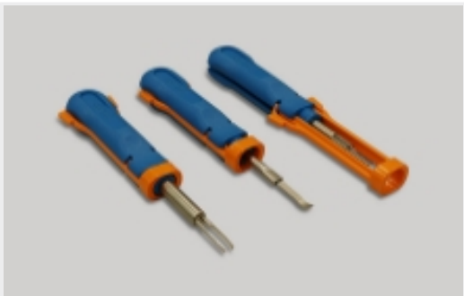
Insertion & Extraction Tools(3)