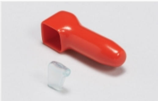
Insulation Boots & Sleeves(4)