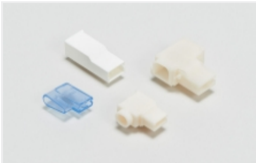
Crimp Terminal Housings(184)