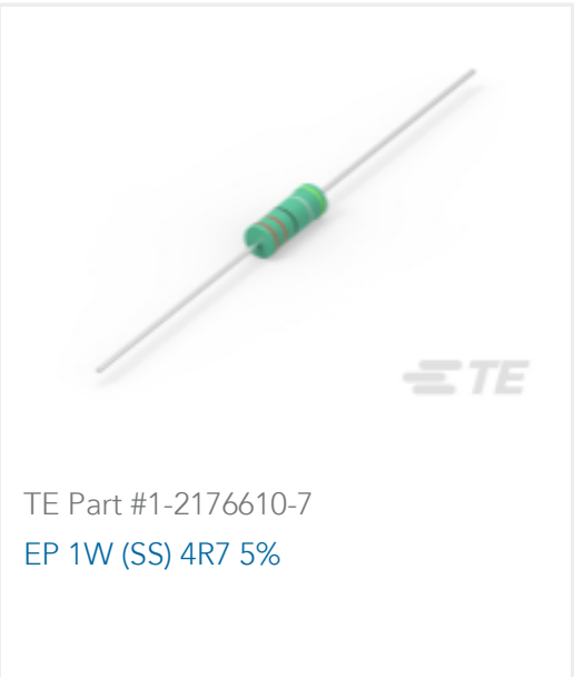
TE Part #1-2176610-7 EP 1W (SS) 4R7 5%

10POS TB HDR 180 DEG, PITCH 5.0&TL 4.5mm