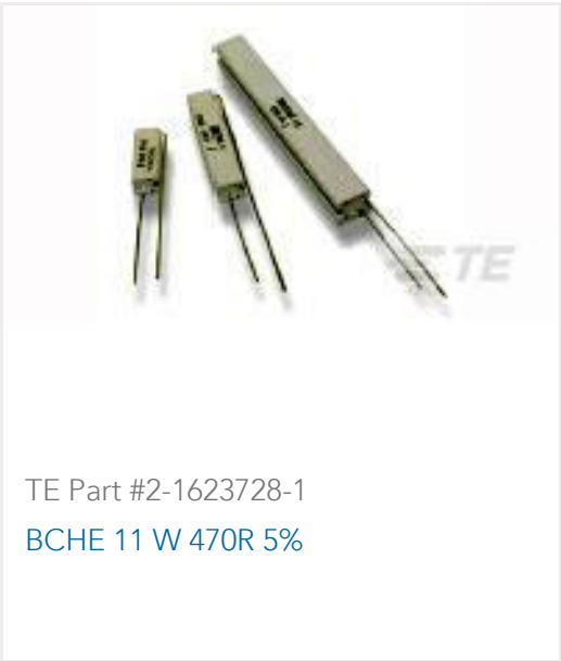
TE Part #2-1623728-1 BCHE 11 W 470R 5%