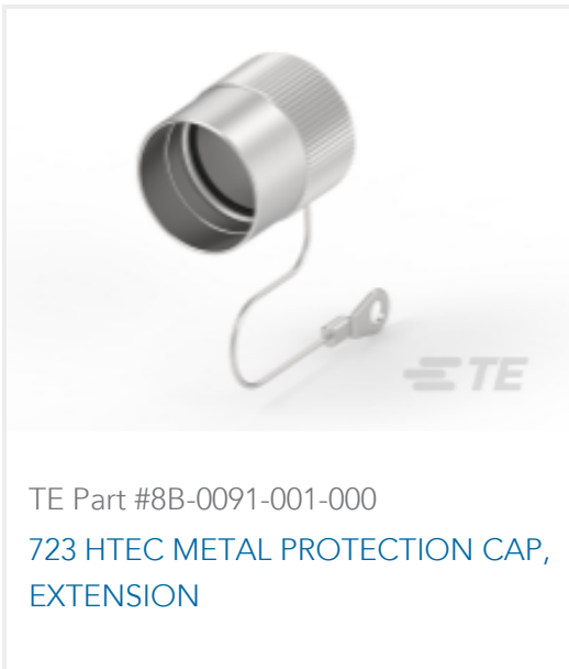
TE Part #8B-0091-001-000 723 HTEC METAL PROTECTION CAP, EXTENSION