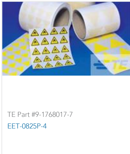
TE Part #9-1768017-7 EET-0825P-4