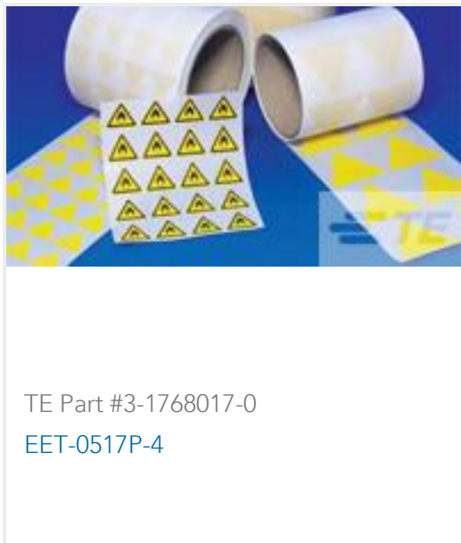
TE Part #3-1768017-0 EET-0517P-4