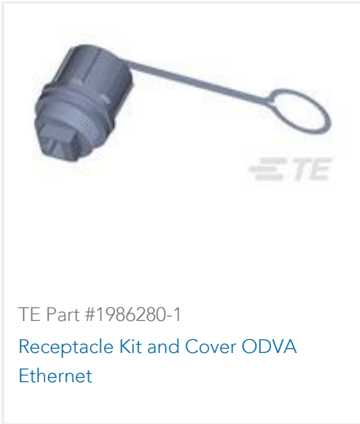
TE Part #1986280-1 Receptacle Kit and Cover ODVA Ethernet