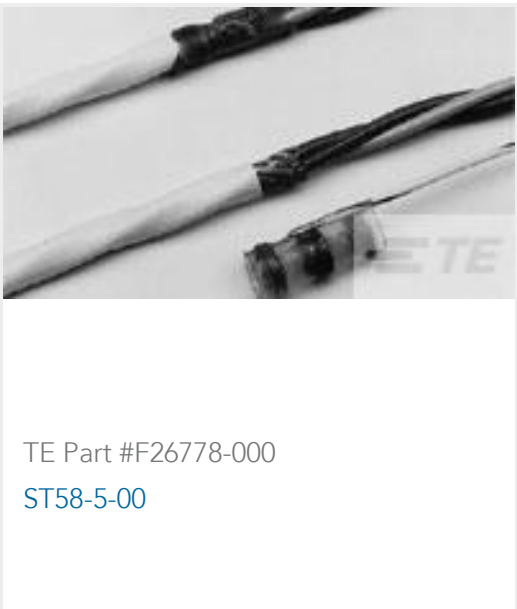
TE Part #F26778-000 ST58-5-00