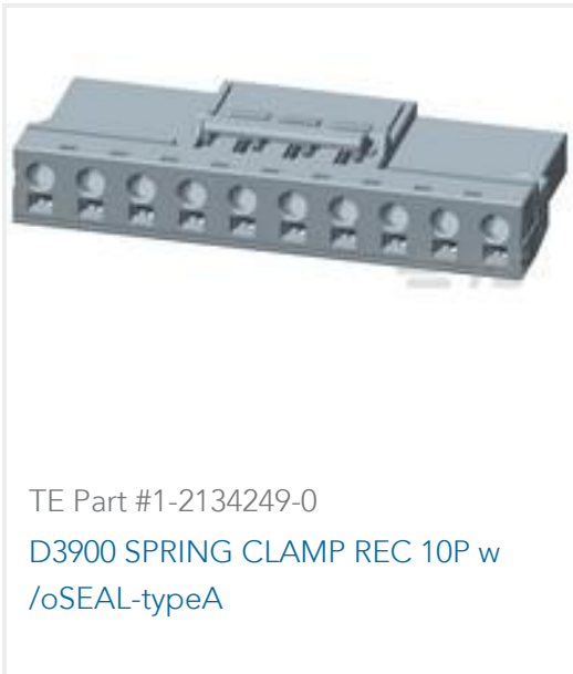
TE Part #1-2134249-0 D3900 SPRING CLAMP REC 10P w /oSEAL-typeA