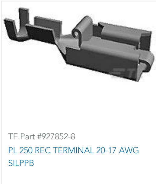
TE Part #927852-8 PL 250 REC TERMINAL 20-17 AWG SILPPB