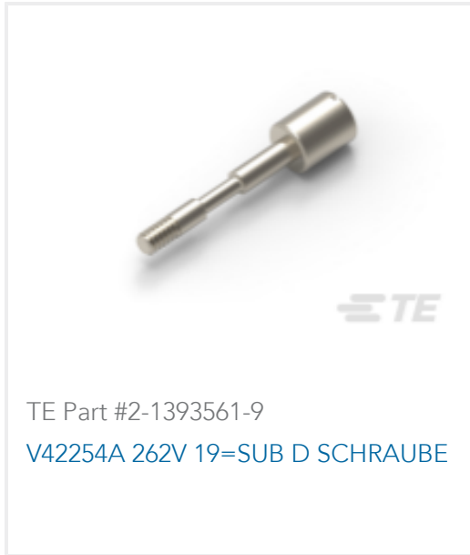
TE Part #2-1393561-9 V42254A 262V 19=SUB D SCHRAUBE