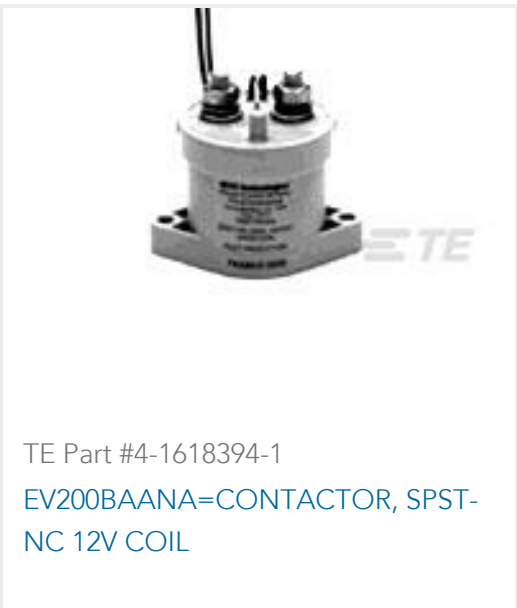
TE Part #4-1618394-1 EV200BAANA=CONTACTOR, SPST-NC 12V COIL