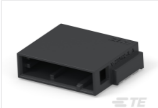
TE Part #2315411-1 8POS,TAB0.5X0.4,HDR ASSY,90DEG, COD A