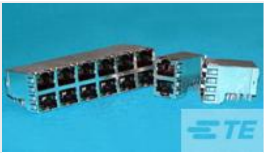
TE Part #6368062-8 2X4 OFFSET STK MJ,SHLD,W/LED