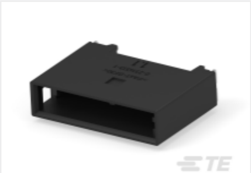
TE Part #2314513-1 10POS,TAB0.5X0.4,HDR ASSY, 180DEG,COD A