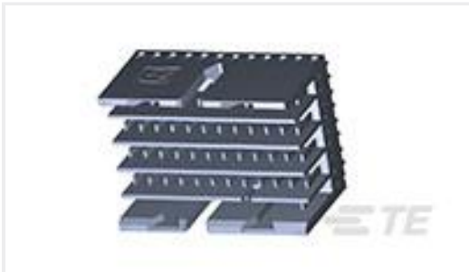
TE Part #1551099-1 Vert.Male, Telcordia Pre-post 1x