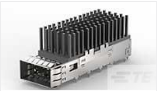
TE Part #2170704-9 CAGE ASSY, QSFP28 1X1, SPRING, HS