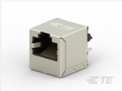
TE Part #2301995-1 RJ45 JACK INT.MAG. 1GB 1X1 VERT.