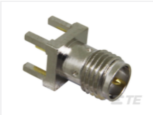
TE Part #CONREVSMA001 RP-SMA Jack 50 Ohm PCB Through Hole