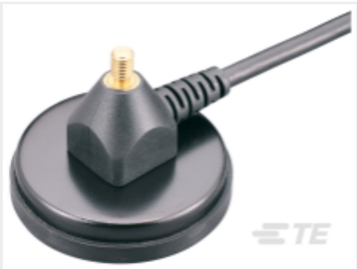
TE Part #ANT-MAG-B50-SMA Antenna Magnetic Base 50mm RG174 4M SMA