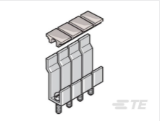
TE Part #1SNA116541R1200 BJA6-10