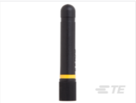
TE Part #ANT-916-CW-RH Antenna 1/4 Wave Short 916MHz RPS