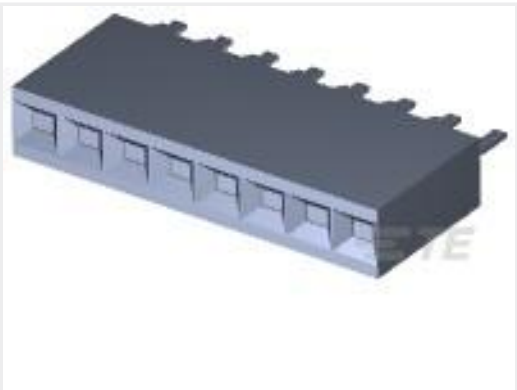
TE Part #535541-6 08 MODIV VRT SR CE 100/115