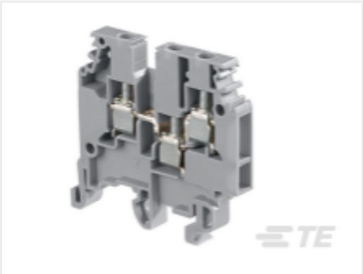
TE Part #1SNA115468R2000 M4/6.3A