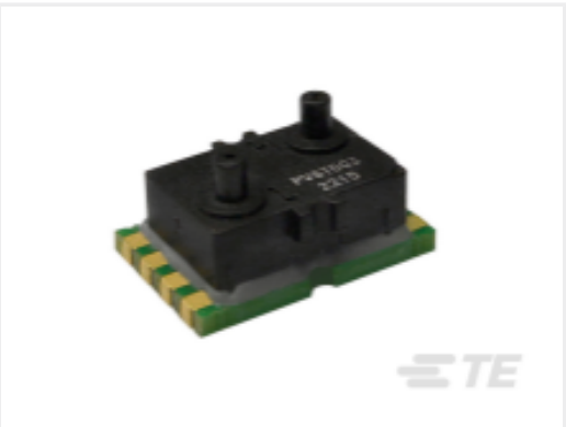
TE Part #1010383-F LMIS025BB3S; PRES; 25Pa;l2C;3Vs