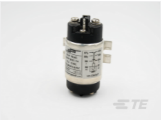
TE Part #K1126416 Relay 29-011-12A