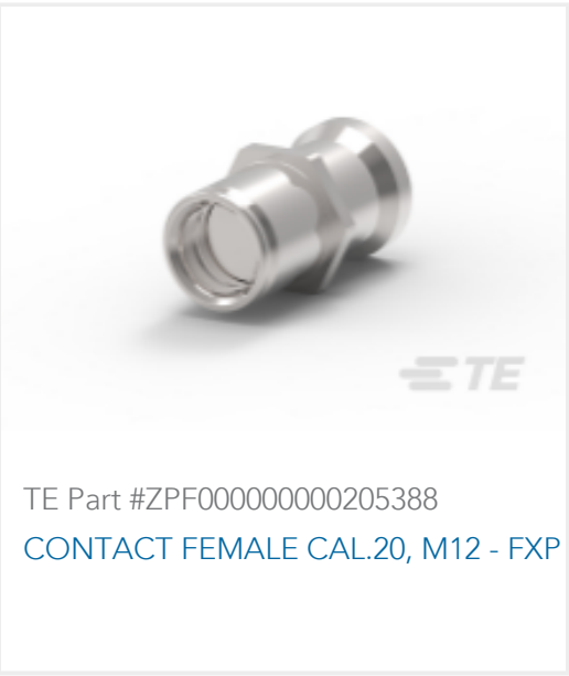
TE Part #ZPF000000000205388 CONTACT FEMALE CAL.20, M12 - FXP