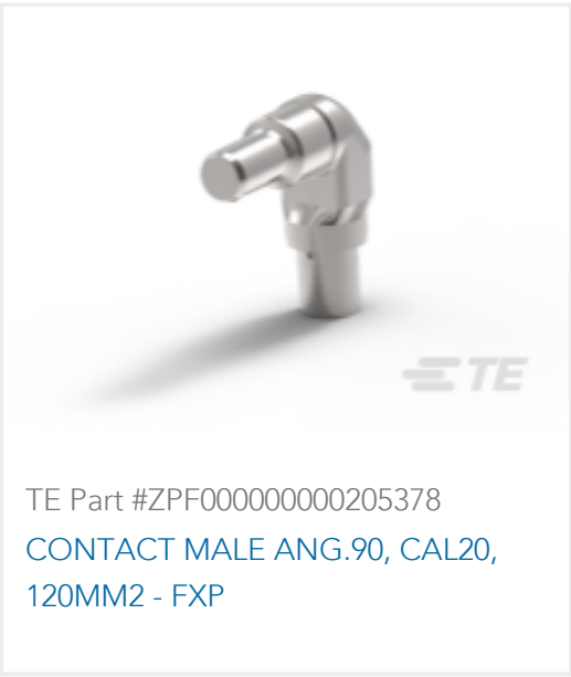
TE Part #ZPF000000000205378 CONTACT MALE ANG.90, CAL20, 120MM2 - FXP