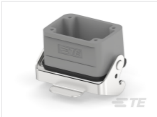
TE Part #T1730060000-000 H6B-TBF-T