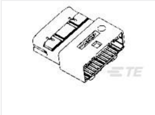
TE Part #1473203-1 025 CAP ASSY 16P P/BACK BRCKT