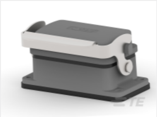
TE Part #T2120100220-000 ZGGP-H10BSK 1-7/2-8/3-9/4-6/5-10