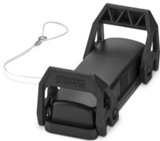
Protective cover B24, with double locking latch, protective cover material: PC, height: 25.4 mm, seal: yes

Please be informed that the data shown in this PDF document is generated from our online catalog. Please find the complete data in the user documentation. Our general terms of use for downloads are valid.