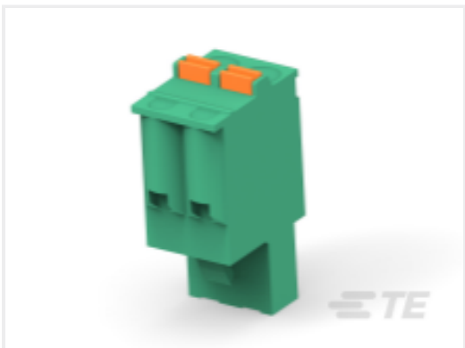
TE Part #2350397-2 2 POS SPRING TB PLUG, PITCH 5.00