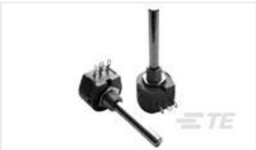
TE Part #1676979-7 TW 1W 2K5 6.35X25PL