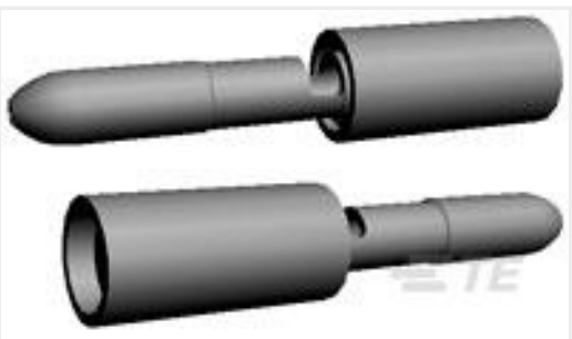
TE Part #141462-1 TERMINAL PIN PIDG 12 16