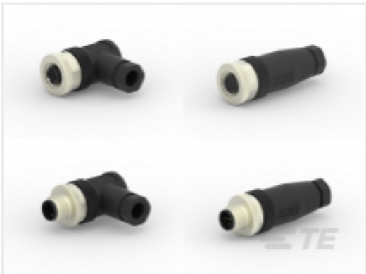
TE Part #CAT-C73765-M1E M12 Field Installable Unshielded