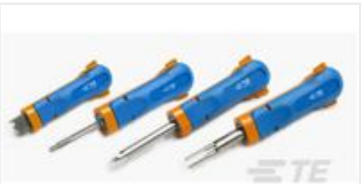
TE Part #539972-1 EXTRACTION TOOL