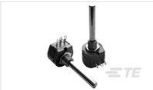
TE Part #1-1676979-1 TW 1W 5K 6.35X25PL