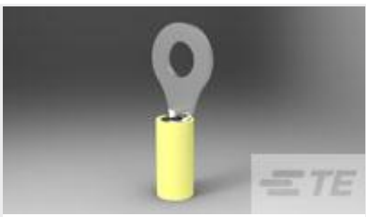
TE Part #696424-7 TERMINAL,PIDG PVF2 R 12-10 1/4