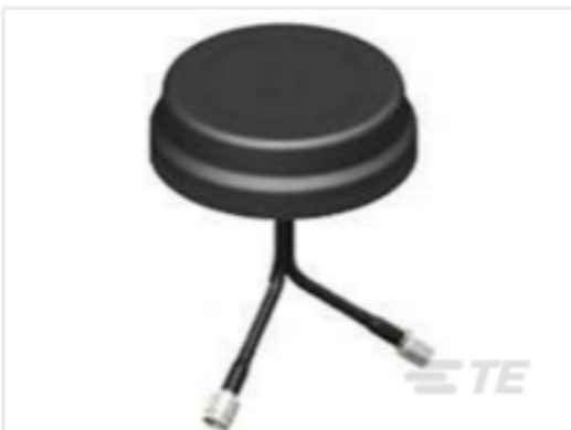
TE Part #VMD24493RSM-366 MIMO,802.11,X2,12FT,RSMA