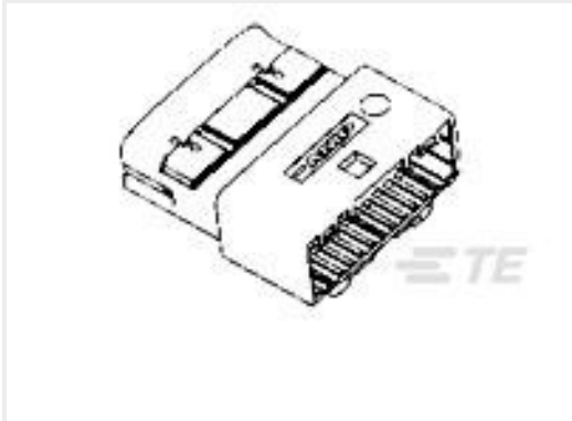
TE Part #1473203-1 025 CAP ASSY 16P P/BACK BRCKT