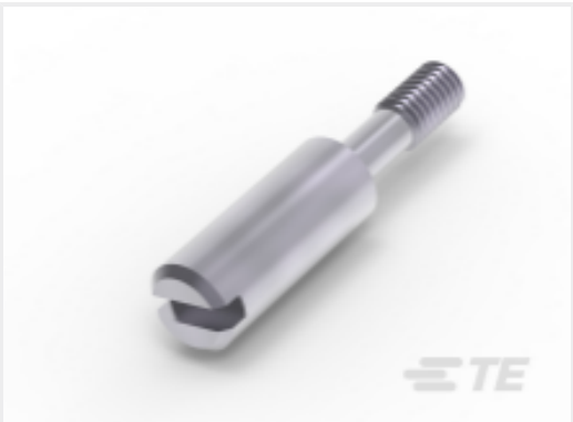
TE Part #T0931003003-000 CODING-PIN-M3