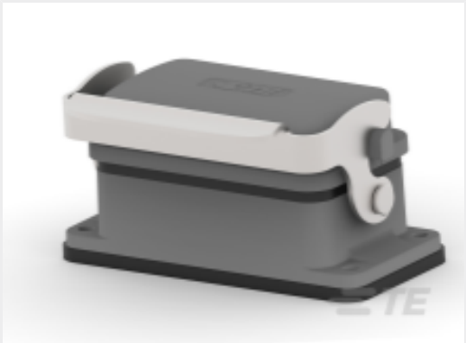
TE Part #T2120100220-000 ZGGP-H10BSK 1-7/2-8/3-9/4-6/5-10