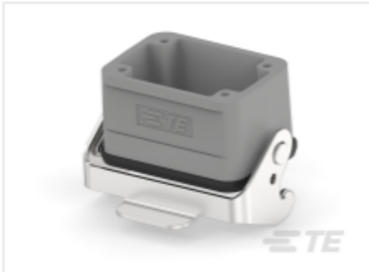
TE Part #T1730060000-000 H6B-TBF-T