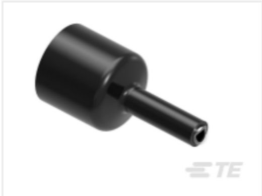
TE Part #NB07552001 HTAT-16/4-0-STK