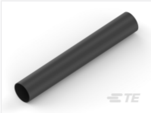
TE Part #NB09542001 ATUM-16/4-0-STK