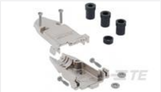
TE Part #5748676-1 DIE CAST CBL CLMP KIT,SZ 1