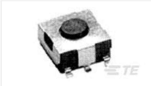
TE Part #1-1437565-8 FSM1LPATR=TACT SWITCH 6X6MIL S