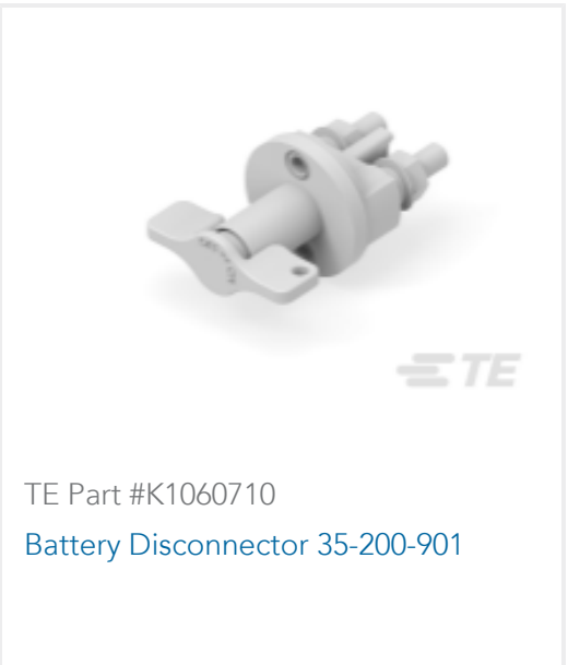
TE Part #K1060710 Battery Disconnecter 35-200-901