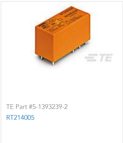
TE Part #5-1393239-2 RT214005