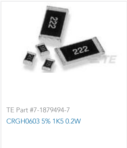
TE Part #7-1879494-7 CRGH0603 5% 1K5 0.2W