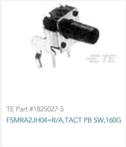
TE Part #1825027-5 FSMRA2JH04=R/A,TACT PB SW,160G