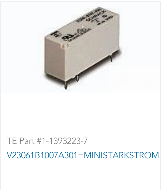
TE Part #1-1393223-7 V23061B1007A301=MINISTARKSTROM