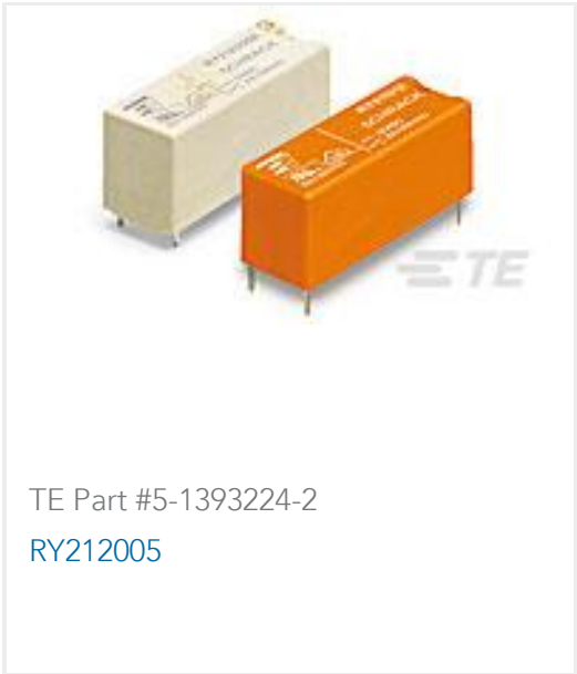
TE Part #5-1393224-2 RY212005