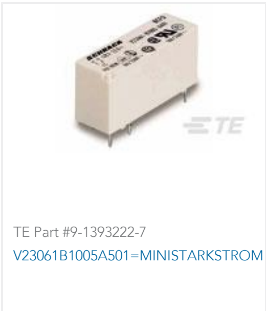
TE Part #9-1393222-7 V23061B1005A501=MINISTARKSTROM