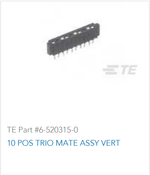
TE Part #6-520315-0 10 POS TRIO MATE ASSY VERT