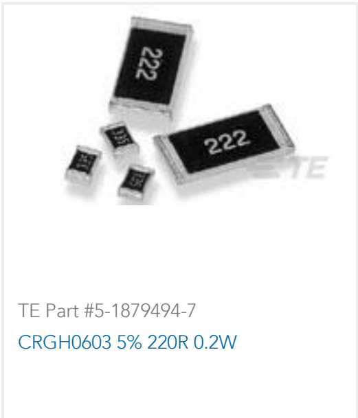
TE Part #5-1879494-7 CRGH0603 5% 220R 0.2W