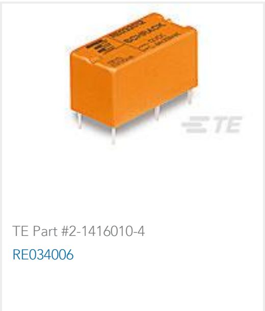
TE Part #2-1416010-4 RE034006