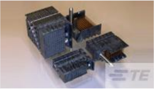
TE Part #2057747-3 IMP100S,H,V2P16C,UG,REW46,5.5