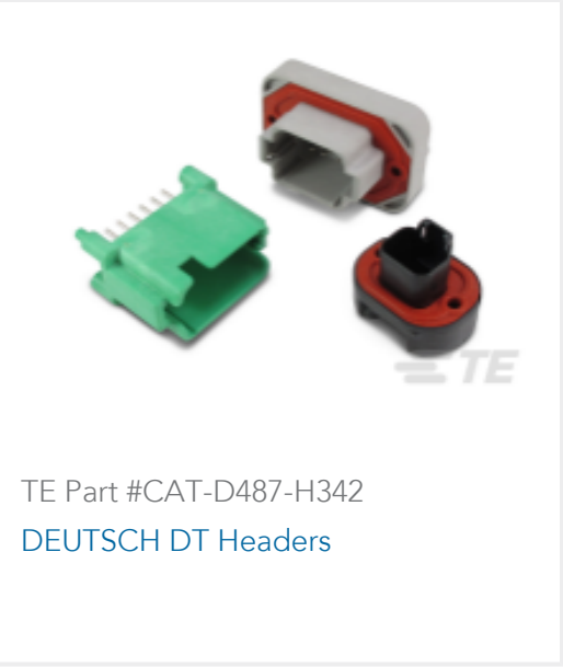
TE Part #CAT-D487-H342 DEUTSCH DT Headers