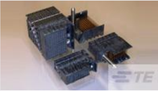
TE Part #2057745-3 IMP100S,H,V2P16C,UG,LEW46,5.5