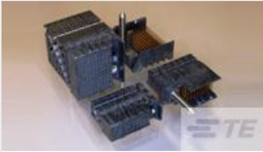
TE Part #2057405-1 IMP100S,R,RA2P10C,UG,39