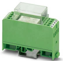
Relay module, with soldered-in miniature switching relay, contact (AgNi+Au): small to large loads, 1 changeover contact, input voltage 24 V AC/DC

Please be informed that the data shown in this PDF document is generated from our online catalog. Please find the complete data in the user documentation. Our general terms of use for downloads are valid.