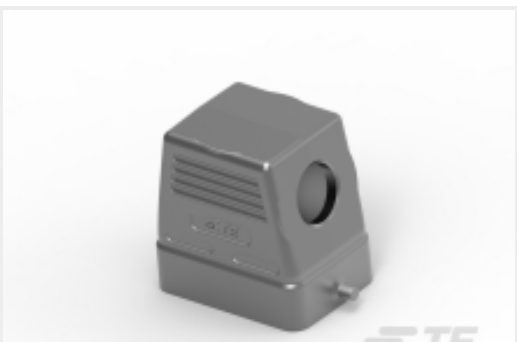
TE Part #T1310060120-000 H6B-TS-M20