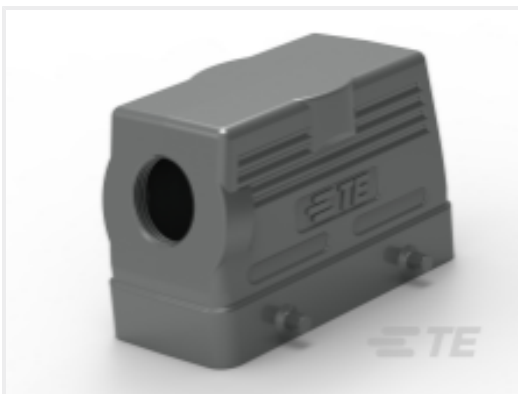
TE Part #T1210160125-000 H16B-TS-M25