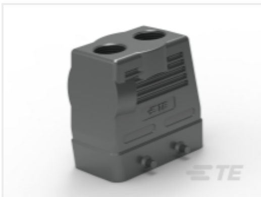
TE Part #T1240100220-000 H10B-TGH-2M20