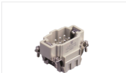
TE Part #T2040063101-000 HE-006-MS