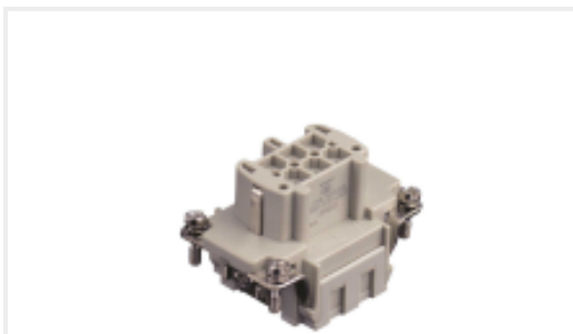
TE Part #T2040063201-000 HE-006-FS