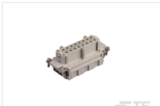
TE Part #T2040163201-000 HE-016-FS