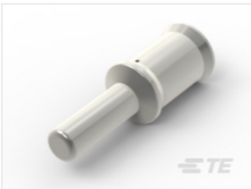
TE Part #T2400001160-000 CSM-16