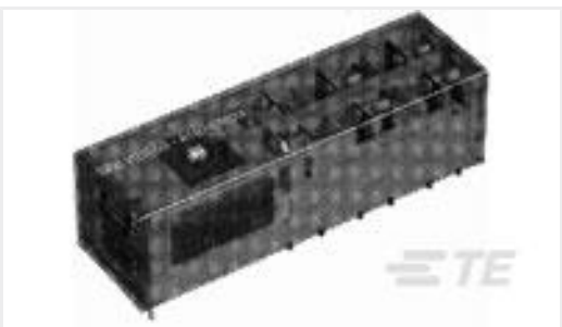
TE Part #1393260-7 SR6B4024 - V23050-A1024-A542