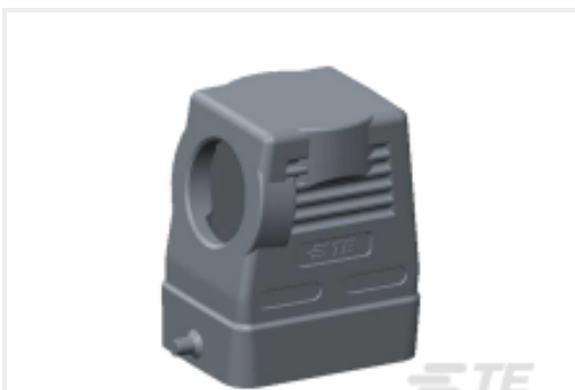
TE Part #T1330060132-000 H6B-TSH-M32