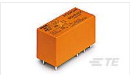
TE Part #1-1649329-5 RT424024