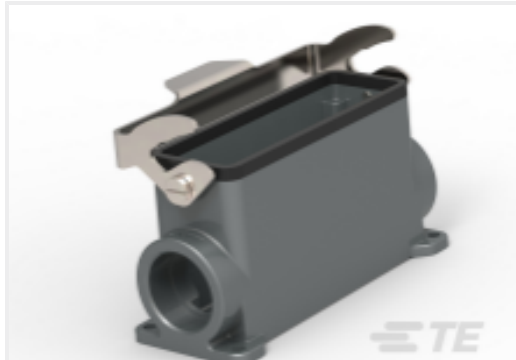
TE Part #T1650243229-000 H24B-SGRH-LB-2PG29