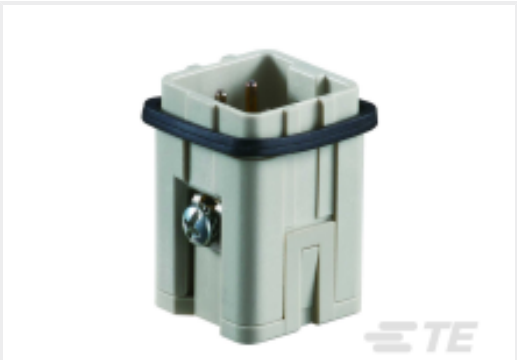
TE Part #T2010033101-000 HA-003-MS