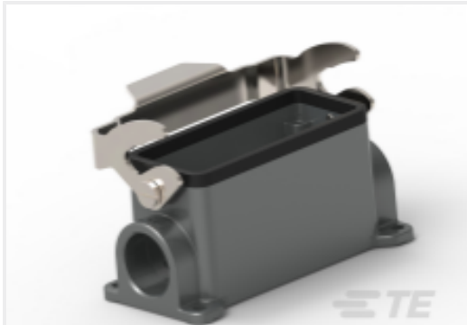
TE Part #T1610163221-000 H16B-SGR-LB-2PG21