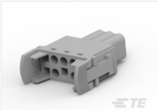
TE Part #T2110052201-000 HMN-005-FS