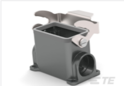
TE Part #T1610103221-000 H10B-SGR-LB-2PG21