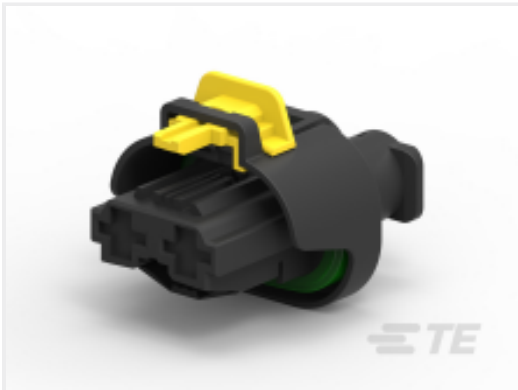
TE Part #1544650-1 PC 2V 8NG1 NOIR JT