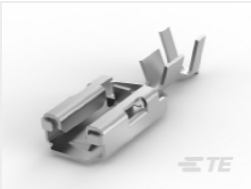
TE Part #85069-2 250 P.LOCK REC