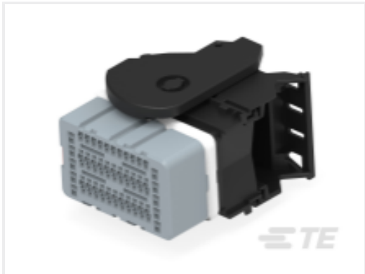
TE Part #2050836-2 PACKAGE COMPONENT FOR 65P MIXED PLUG HSG