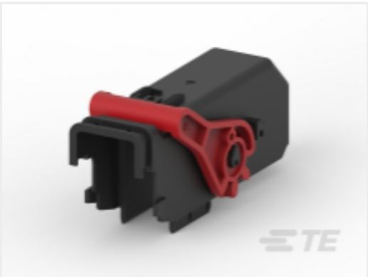
TE Part #1452920-1 30 POS CONNECTOR COVER ASSY