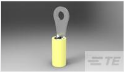
TE Part #52189 TERMINAL,PIDG R 26-24 4