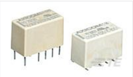
TE Part #6-1393788-9 V23079E1203B301