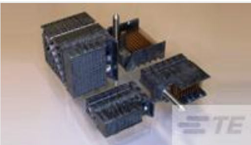
TE Part #2057426-3 IMP100S,H,V2P10C,UG,OEW46,5.5