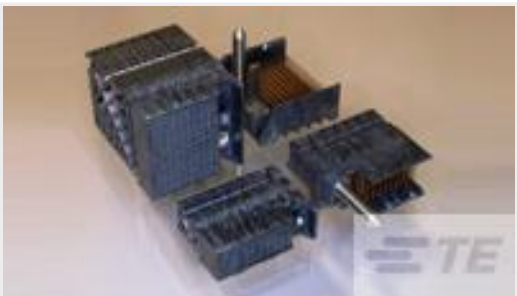
TE Part #2007788-3 IMP100S,H,V3P10C,UG,OEW39,5.5