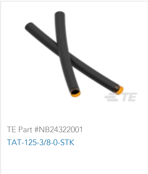
TE Part #NB24322001 TAT-125-3/8-0-STK