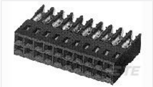
TE Part #6-102398-2 28 AMPMODU MT ASSY DR.100CL SN