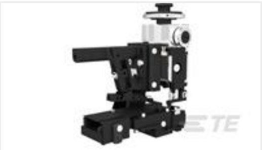
TE Part #2151117-1 OCEAN_2.0_Applicator-S-080F130F-RSM