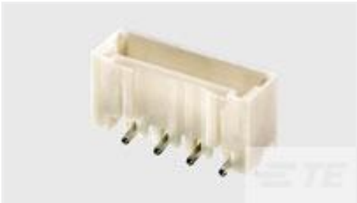
TE Part #1-292231-7 1.5 MINI CT SGL V SMT W/O BOSS