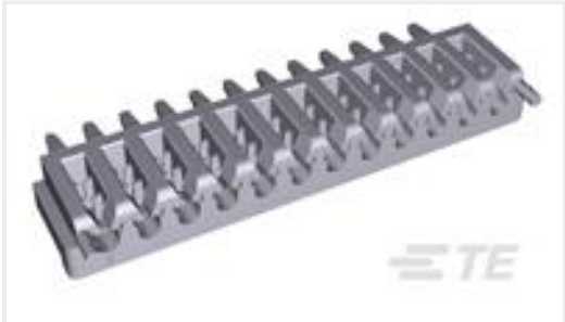
TE Part #3-173985-3 AMP CT MT AMP-IN HDR-V BLU 13P