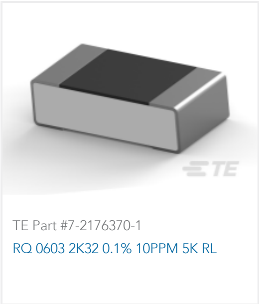
TE Part #7-2176370-1 RQ 0603 2K32 0.1% 10PPM 5K RL