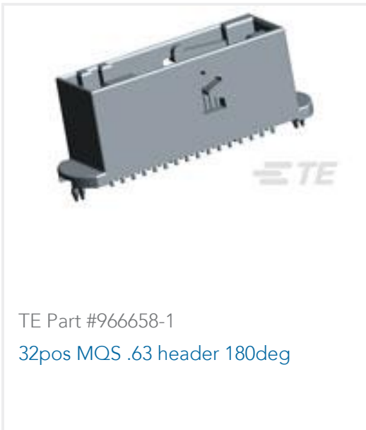
TE Part #966658-1 32pos MQS .63 header 180deg