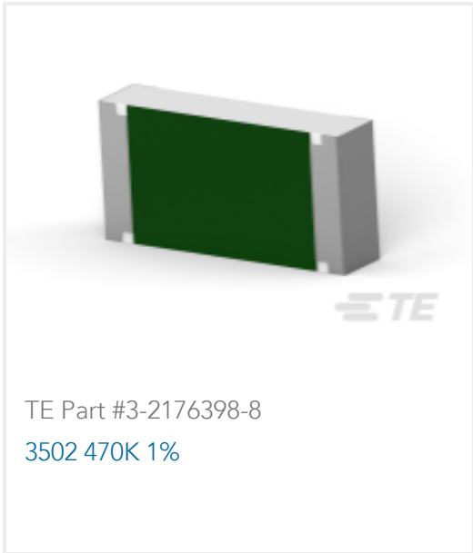
TE Part #3-2176398-8 3502 470K 1%