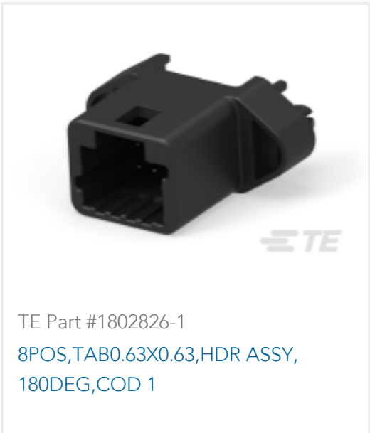
TE Part #1802826-1 8POS, TAB0.63X0.63, HDR ASSY, 180DEG, COD 1