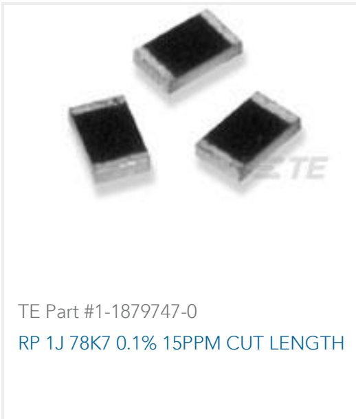
TE Part #1-1879747-0 RP 1J 78K7 0.1% 15PPM CUT LENGTH