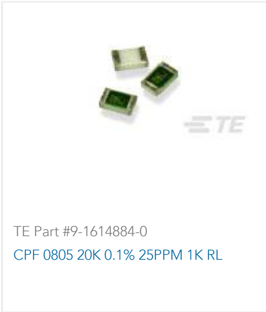
TE Part #9-1614884-0 CPF 0805 20K 0.1% 25PPM 1K RL