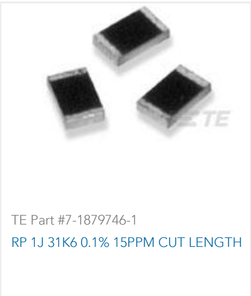
TE Part #7-1879746-1 RP 1J 31K6 0.1% 15PPM CUT LENGTH