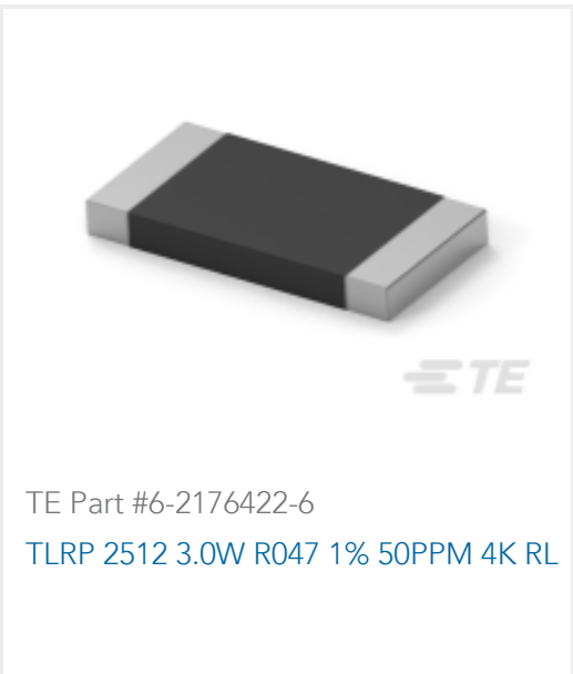
TE Part #6-2176422-6 TLRP 2512 3.0W R047 1% 50PPM 4K RL