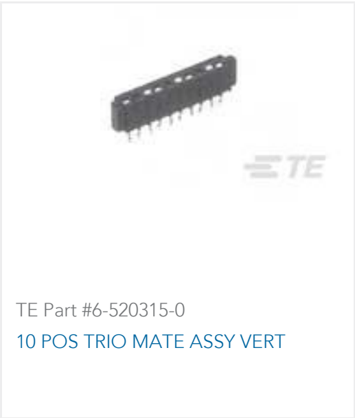
TE Part #6-520315-0 10 POS TRIO MATE ASSY VERT