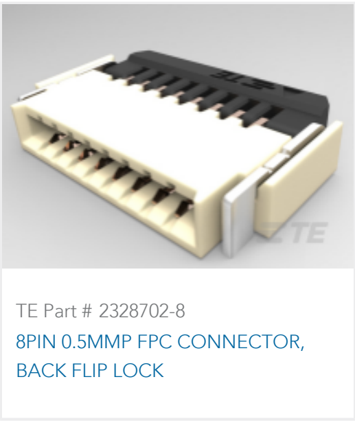
TE Part # 2328702-8 8PIN 0.5MMFP FPC CONNECTOR, BACK FLIP LOCK