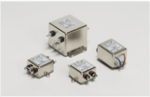
Single Phase Filters(11)