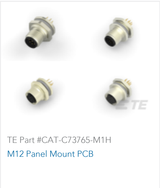
TE Part #CAT-C73765-M1H M12 Panel Mount PCB