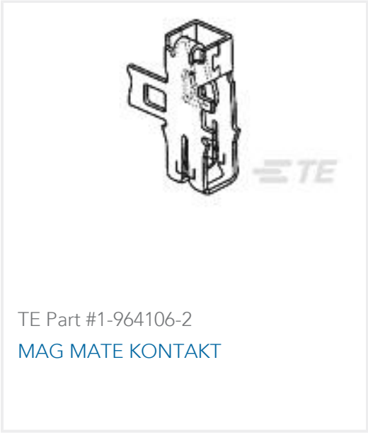
TE Part #1-964106-2 MAG MATE KONTAKT

23POS, PIN DIA 1.3, HDR ASSY, 180DEG, COD 4