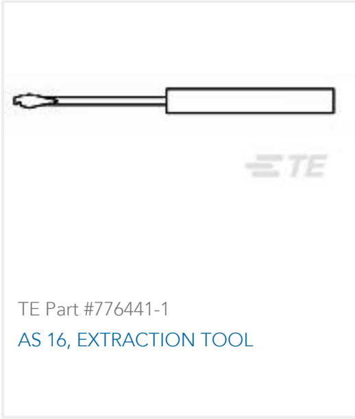
TE Part #776441-1 AS 16, EXTRACTION TOOL