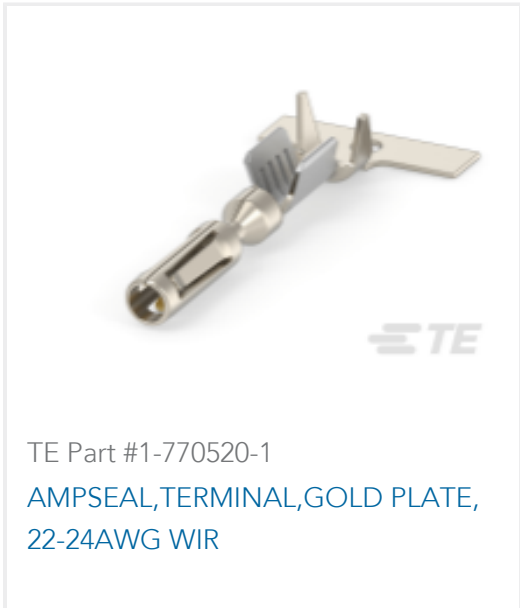
TE Part #1-770520-1 AMPSEAL, TERMINAL, GOLD PLATE, 22-24AWG WIR