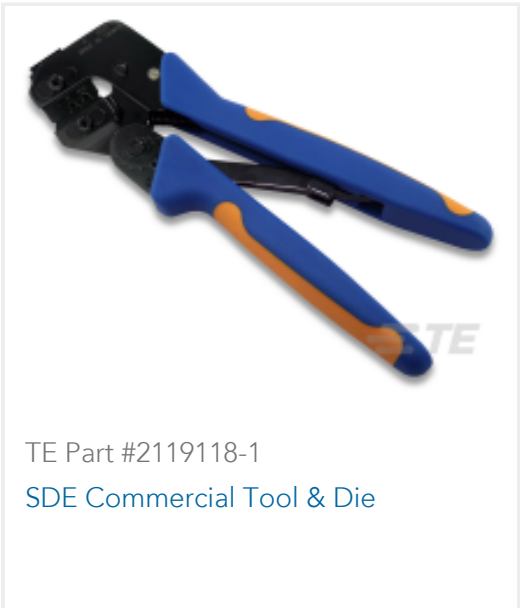
TE Part #2119118-1 SDE Commercial Tool & Die