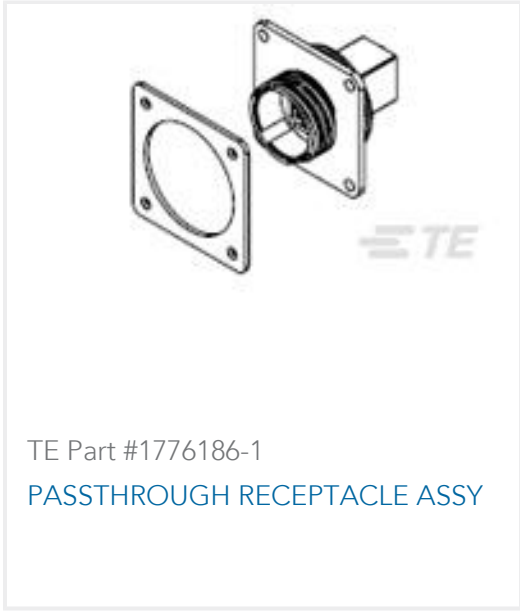
TE Part #1776186-1 PASSTHROUGH RECEPTACLE ASSY