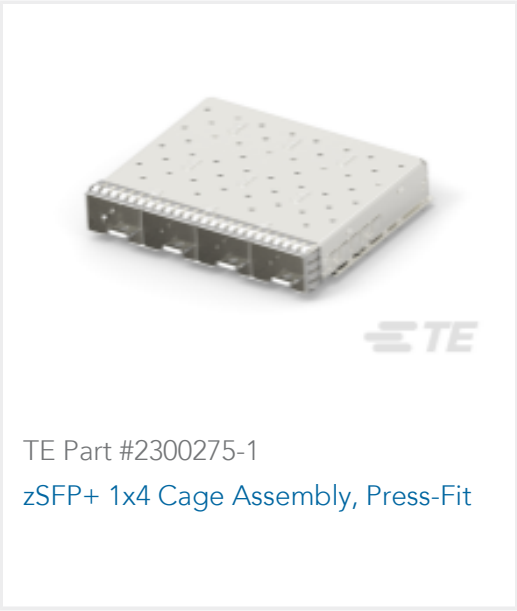
TE Part #2300275-1 zSFP+ 1x4 Cage Assembly, Press-Fit